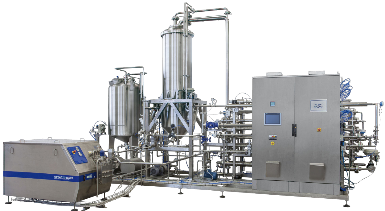
Steritherm DSI 2000